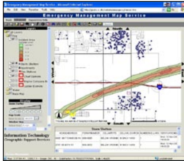
A screen shot shows one use of GIS in emergency management, in this case, mapping the path of a tornado.

Leadership. In the early 1990s, the National Spatial Data Infrastructure (NSDI) was established as a framework for coordinating the production, distribution, and use of geospatial data. Currently, NSDI provides a means for sharing geospatial data, but the special needs of emergency management have not been fully recognized. The current system of governance should be strengthened to include the full range of agencies, governments, and sectors that share geospatial data and tools, in order to provide strong national leadership. The Department of Homeland Security (DHS) should play a leading role in ensuring that the special needs of emergency management for